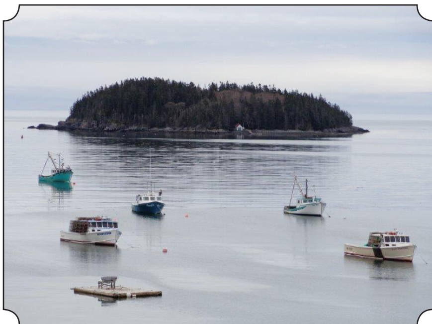
Town Photos courtesy of Teresa Bragg