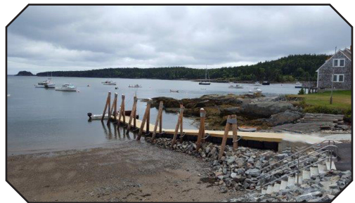
New Cutler Boat Ramp